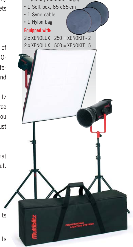
XENOKIT Location Set