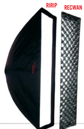
RIRIP 30, 30 x 140 cm RECWAN 30, 30 x 140 cm