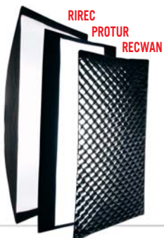
RIREC 60/80, 60 x 100 / 80 x 140 cm PROTUR, für RIREC 60 RECWAN 60/80, 60 x 100 / 80 x 140 cm