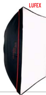
LUFEX 65, 65 x 65 cm