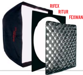
RIFEX 80/110, 75 x 75 / 110 x 110 cm RITUR 80/110, 75 x 75 / 110 x 110 cm FEXWAN 80/110, 75 x 75 / 110 x 110 cm